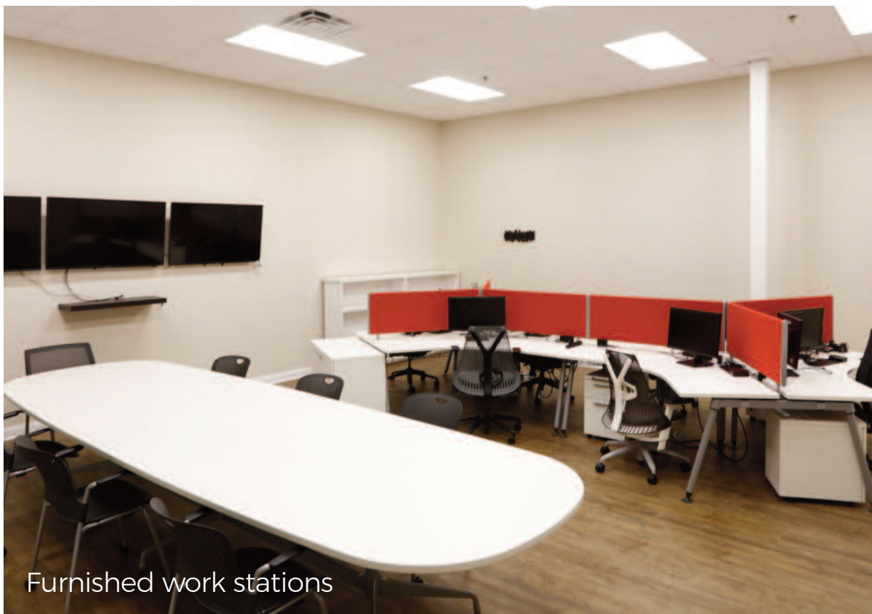
Furnished work stations