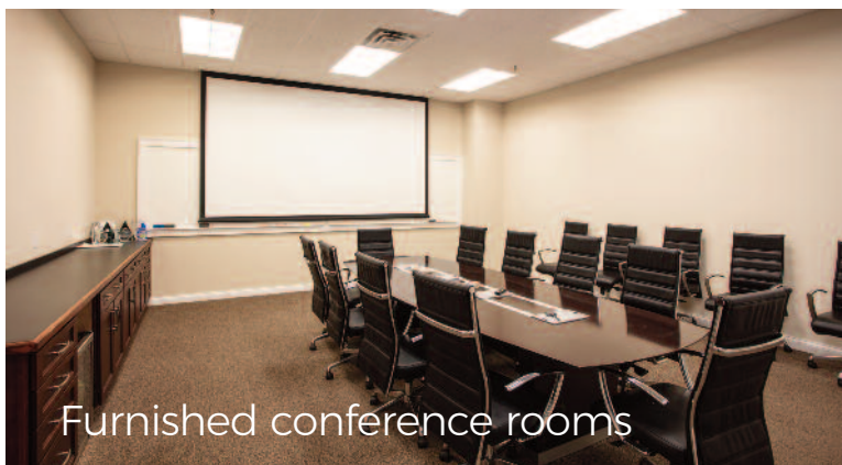
Furnished conference rooms