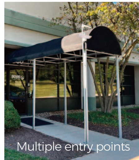
Multiple entry points