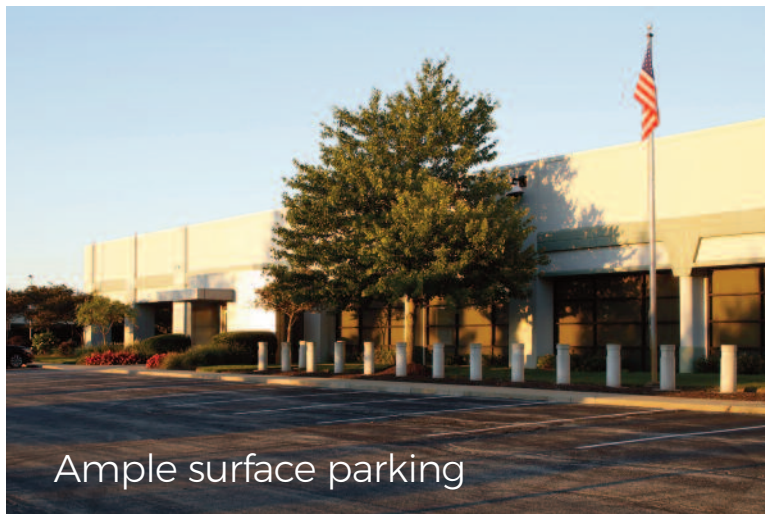
Ample surface parking