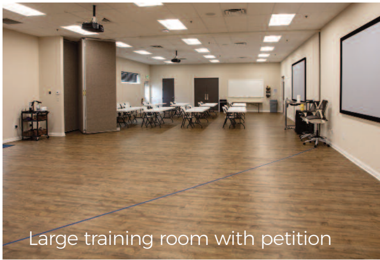
Large training room with petition