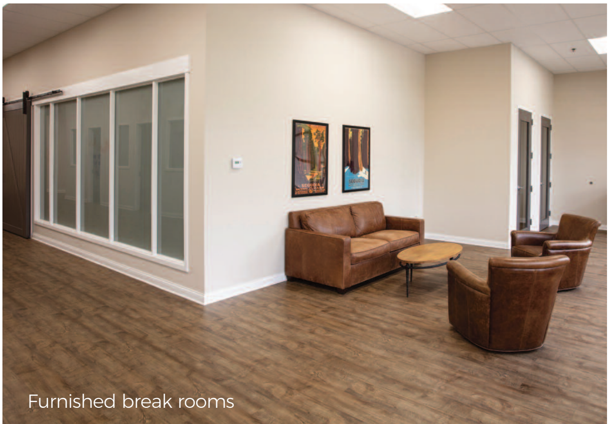
Furnished break rooms