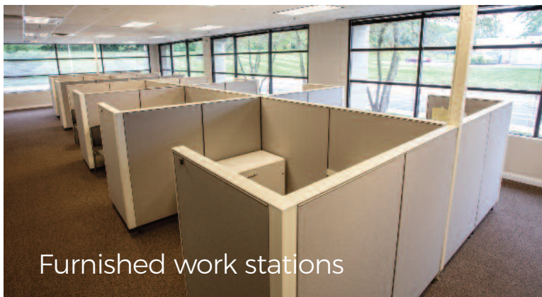
Furnished work stations