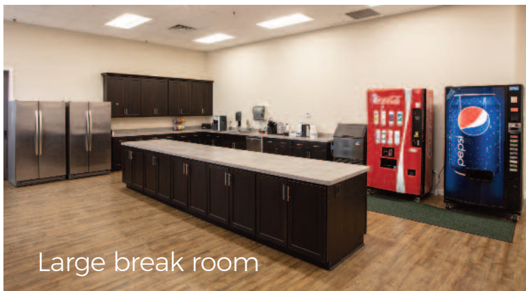
Large break room